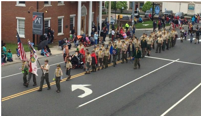
Troop 52 marching up Main Street during Watertown's Memorial Day Parade

On Monday morning, Troop 52 assembled at Adams Plaza to continue a tradition as old as the troop itself. 28 Boy Scouts and 12 adult leaders marched with the troop in the 2017 Memorial Day Parade. The route went uphill along Main Street to the Gazebo in Watertown. The column of Boy Scouts which included the town's other two troops, 55 and 140, was led by our troop. Several more Troop 52 Boy Scouts marched with their school's band or the High School Robotics team.