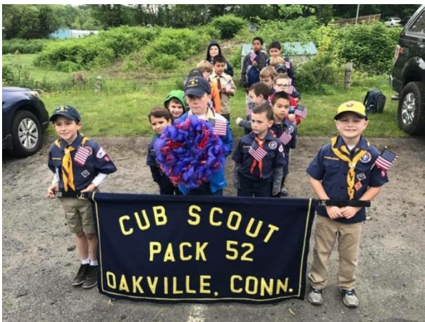
Pack 52 Cub Scouts gather before the Memorial Day parade at Adam's Plaza.

In other Cub Scout news, their annual flower sale was held on Mother's Day weekend and was a huge success. Members of the Pack helped patrons carry flowers back to their cars and were a huge help. All proceeds from the sale go back to the pack and pay for books, advancements, and trips.