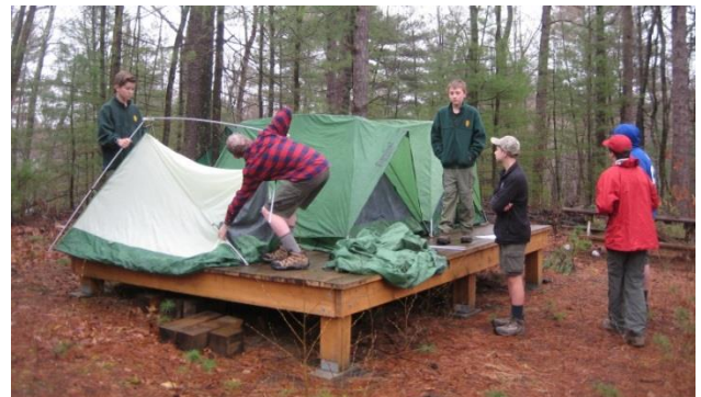
Troop 52 Boy Scouts at Session Woods in Burlington on the weekend of April 22 nd (above) and a Patrol on Lake Kenosha during the Huck Finn Camporee (below)

9 Boy Scouts and 6 adult leaders from Troop 52 took part in the Hick Finn Camporee held at Camp Mattatuck on May 14 th . Patrols competed against other Mad River District patrols and raced around Lake Kenosha in rafts built specially for the event. Inclement weather, however, significantly shortened the weekend-long camporee into a half-day event. Even though the weather was damp, it did not dampen the scout's enthusiasm.