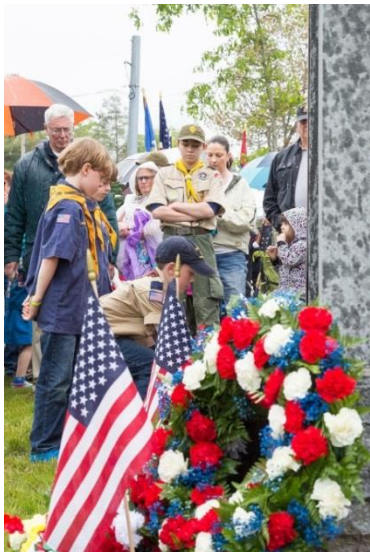
Pack 52 Cub Scouts laying a wreath at the WWII monument after the Memorial Day parade.